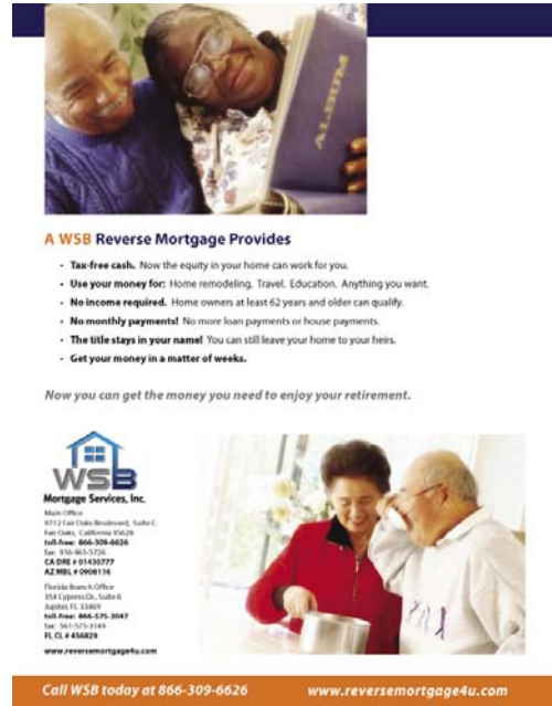
Back Page of Brochure