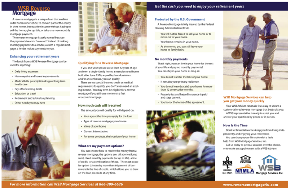
Inside Pages of Brochure

WSB Mortgage Services Inc. 9712 Fair Oaks Blvd. Suite C., Fair Oak Ca. 95628 Toll Free # 866-309-6626 Fax # 916-965-5726 Advisor Website: www.wsbrm.com Client Website: www.reversemortgage4u.com